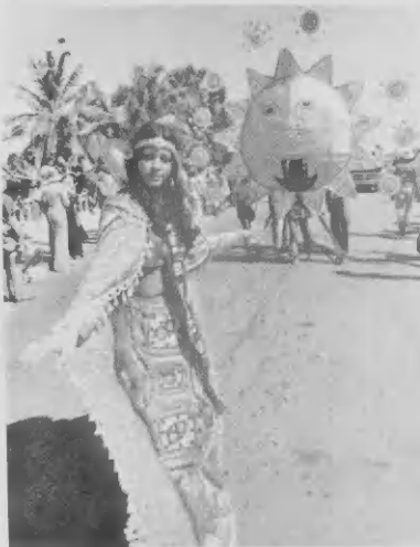
Queen of costumes elected at the Wilhelmina Stadium Feb. 22. An Inca Sun Queen, she represented the Group "The Golden Age of Incas".